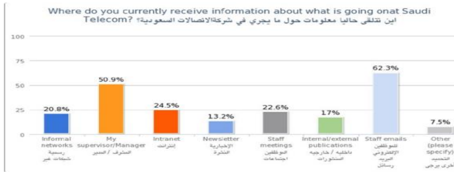
Figure 3: Media used for delivery of information

As seen, various sources of information were indicated. "Staff emails" were the primary source of information according to the majority of