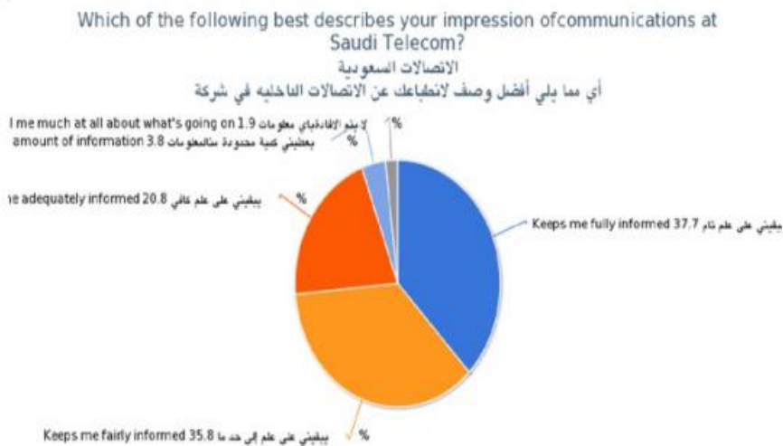
Figure 1: Employees' impression of communication at Sandi Telecom

In exploring how STC employees perceive internal communication at STC, employees (N- 53) were requested to indicate their thoughts about communications at STC. The employees were give five alternatives and asked to select one of them which measures whether communications at Sauch Telecom present enough information to them. The previous pie chart and tables present the responses from the employees. As seen, most participants, 20 (38%) of them, indicated that communications at Saudi Telecom "keeps them fully informed while 19 (36%) participants pointed that communications at Sandi Telecom "keeps them fairly informed". Besides, 11 (21%) participants stated that communications "keep them adequately informed". The number of participants who state that communications at Sand Telecom do not provide information at all is very low. Specifically, only 2 (4%) participants stated that Saadi Telecom "gives them only a limited amount of information" and 1 (2%) of them pointed that Saud Telecom "doesn't tell me much at all about what's going on"